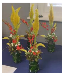
Parade & Procession

A fruit cake in the baking section made such a good impression on the judges that it won Best Exhibit in Show.