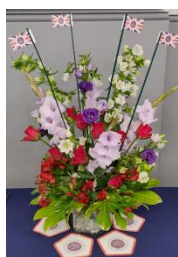
A street-party centrepiece

There was a Jubilee theme to the flower arranging classes