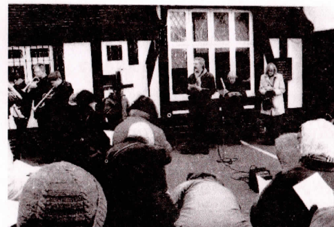
The Walk of Witness, Easter, 2013, walked from St Andrew's Church, on Good Friday, to find the Porcupine closed.